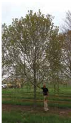
Red Maple Oct.Glory 8"

Red sunset is the most highly rated and reliable of the Red Maple cultivars. It is a vigorous growing tree with a strong and symmetrical branching pattern. The foliage is a very lustrous green in summer, changing to brilliant shades of red and orange-red in the fall.