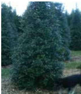
Nellie Stevens Holly

Fast growing upright hollies with black green, textured foliage.