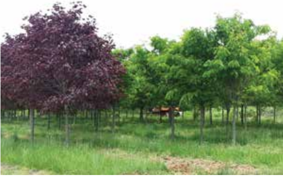
Crimson King Maples/ Zelkova